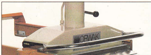
Telescopic cylinder for minimum height.

The 5030-Marine is designed to handle general waste on board ships. You can choose from a round or square drum in various sizes and many options can be fitted to the compactor to suit all requirements.